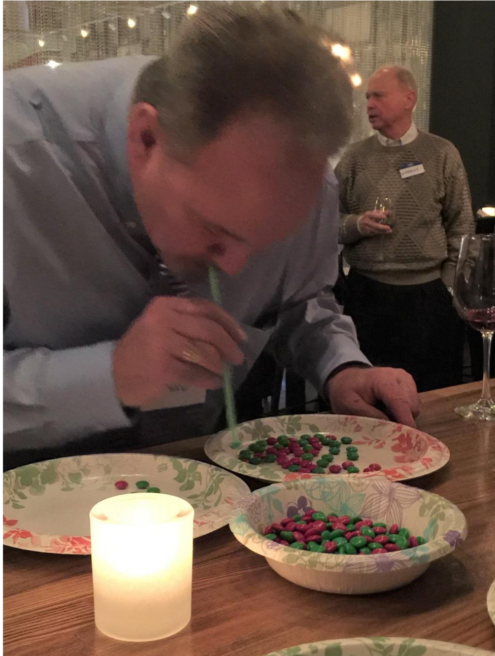
Snorting M&M's- a traditional holiday treat!

We wish you a joyous time this holiday season with friends and family and look forward to seeing you in January.